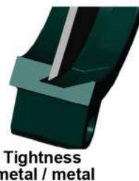
Tightness metal / metal