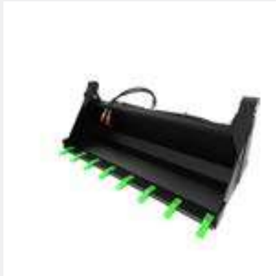
4 in 1 bucket