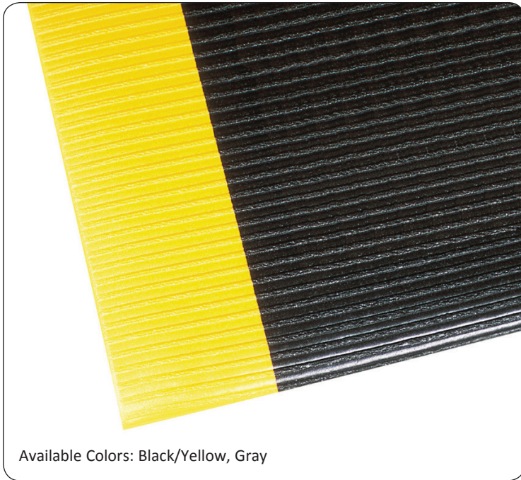
Available Colors: Black/Yellow, Gray