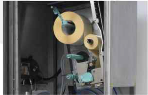
Big labels rolls with a diameter of 203 mm.