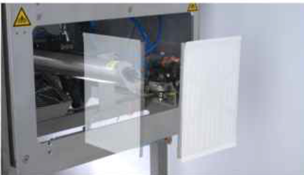
The labelling arm can be turned by 90°.