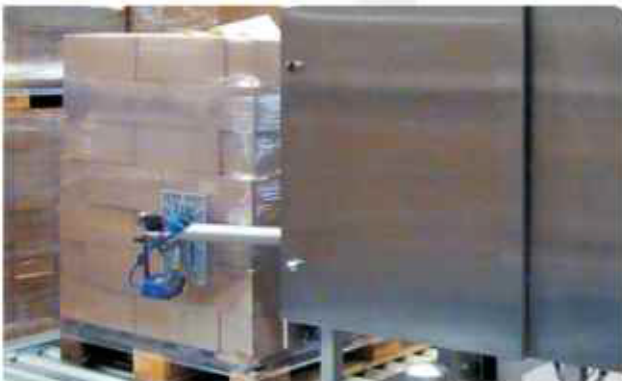
Lateral labelling without turning the pallet.

The printer ESD 404 can be equipped with a big label roll and works independently with or without PC control.