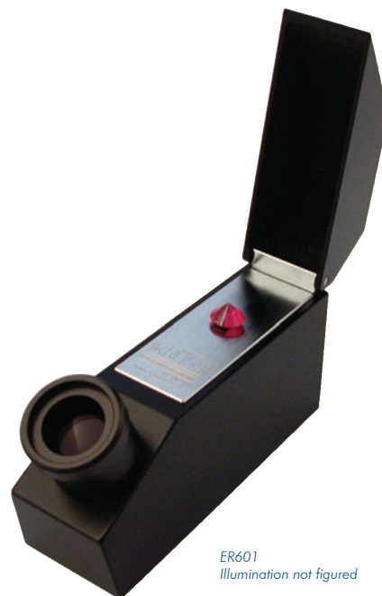
ER601 Illumination not figured

Gemstone refractometers are used for the classification and quality control of gemstones. The gemstone to be examined is simply placed on the prism with a drop of contact fluid. The refractive index of the gemstone is read through the ocular of the refractometer. The refractive index is an important parameter in classifying a mineral or gemstone. Each mineral has its typical refractive index, due to its chemical composition and crystalline structure. Our gemstone refractometers are characterised by their particularly sharp image and good readability. With the sodium filter that only lets through light with a wavelength of 589 nm, the refractometer can be used as a mobile unit with an ordinary light source or with sufficient ambient lighting. LED illumination is also available with a wavelength of 589 nm.