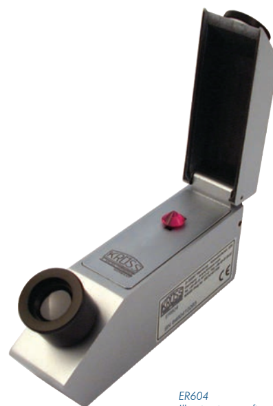
ER604 Illumination not figured