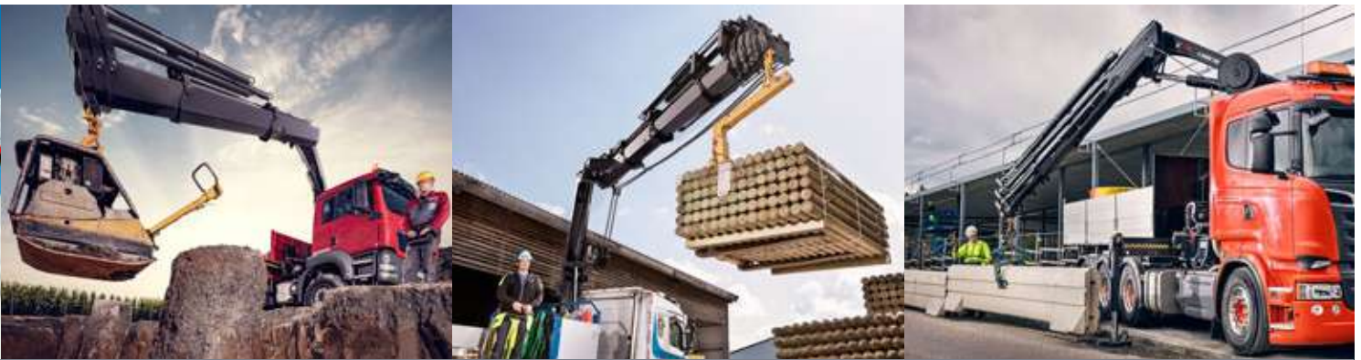
HIAB X-HIDUO 228

Certain HIAB mid-range crane models are also available with an EP boom system, where the E-link construction has been optimised for fewer but longer extensions. This unique construction provides even more power for lifting close to the truck.