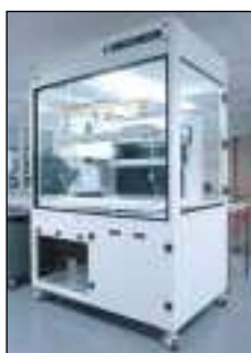
Mobile enclosure for a robotic system