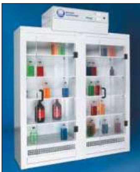
844 Chemical storage cabinet (double)