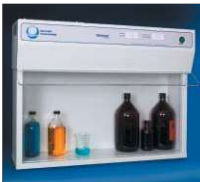
812 Shelf storage cabinet

Bigneat Chemical Storage Cabinets may be supplied as a ducted installation or portable with the Chemcap™ filtration system.