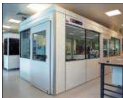
Environmentally controlled room for a mass spectrometer system