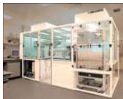
Robotic enclosure for the containment of a high throughput screening system

Bigneat have many years experience in providing solutions to meet the rapid changes and developments of pharmaceutical process technology. Shown here are a few examples of containment solutions; the enclosure of robotics and analytical instrumentation such as preparative HPLC and mass spectrometers. All Bigneat enclosures incorporate local or remote filtration using the Chemcap™ high performance filtration systems or directly duct to atmosphere. Certain models also feature climatic and temperature control.