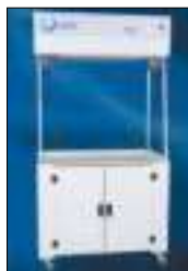
1004 with mobile trolley and cupboard