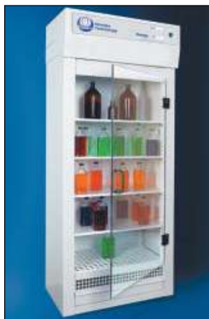
834 Chemical storage cabinet

Evaporation from drips and open containers contributes considerably to poor quality air within the laboratory. The Bigneat range of storage cabinets removes vapours, purifies air and enhances the long-term health of laboratory personnel.