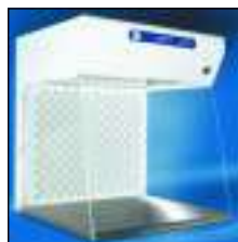
1000 Chemical Workstation

Bigneat Horizontal Flow Workstations are ideal for use when working with chemicals, where there is a need for a strong horizontal airflow across the working surface. Air is drawn through rear baffles, before passing through the Chemcap™ filtration system, ensuring an even and non-turbulent flow pattern.