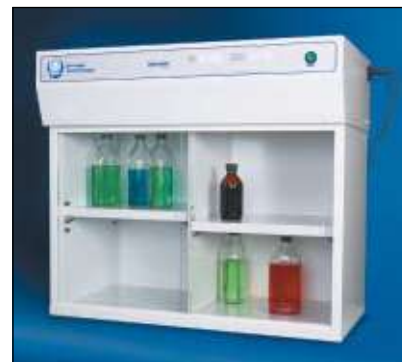
822 Mini storage cabinet