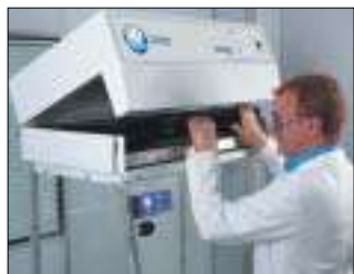
Chemcap™ filters are easily accessed for servicing