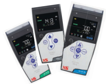
Conductivity meter and Multiparameter