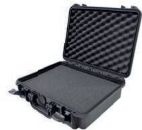
IP 67 case - optional cod. 50010972