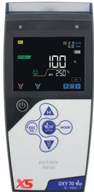
Only 6 buttons to easily manage all the functions of the instrument.