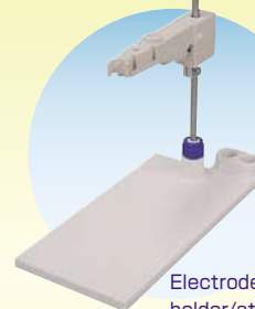
Electrode stand/ holder/attachment