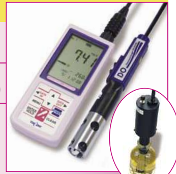
DO electrode for the incubator bottle

Note : For conducting BOD measurements, please place orders for the "main unit only" and the "DO electrode for the incubator bottle OE-470AA".