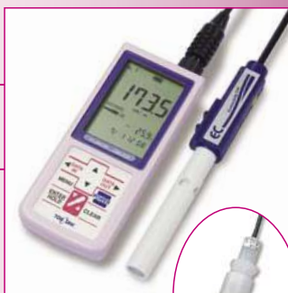
Electrical conductivity cell for pure water

Make sure to select the one that best fits your needs.