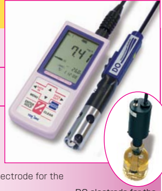
DO electrode for the incubator bottle

1) JIS middle type TS19/22(MAX dia. 18.8mm, MIN dia. 16.6mm, 22mm length)