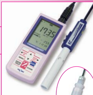
Electrical conductivity cell for pure water

Make sure to select the one that best fits your needs.