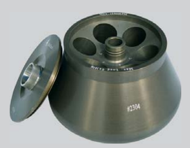
#2304 fixed angle rotor