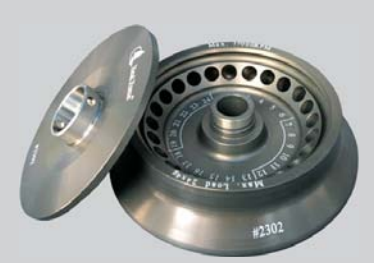
#2302 fixed angle rotor