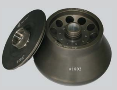
#1802 fixed angle rotor