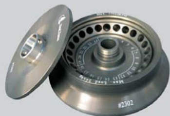
#2302 fixed angle rotor