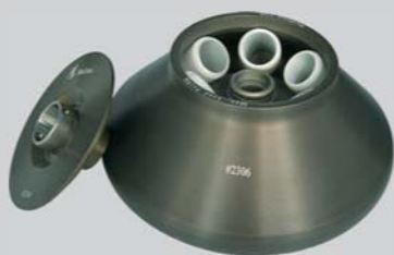
#2306 fixed angle rotor