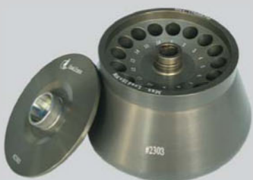
#2303 fixed angle rotor