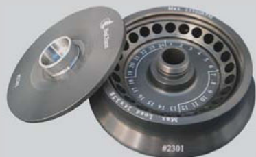
#2301 fixed angle rotor