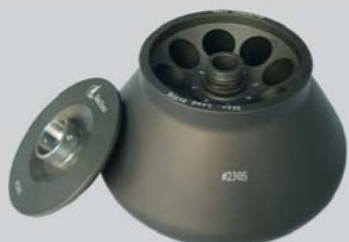
#2305 fixed angle rotor