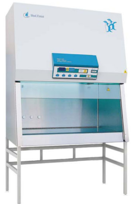
Biological Safety Cabinet