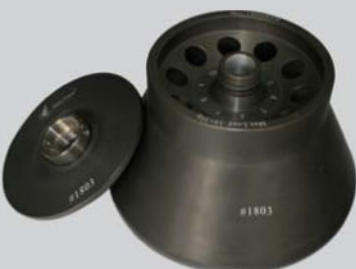
#1803 fixed angle rotor