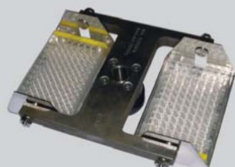
#2308 microplate rotor