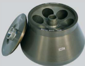
#2304 fixed angle rotor