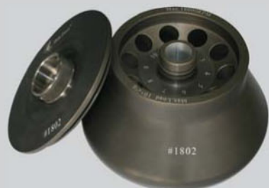
#1802 fixed angle rotor