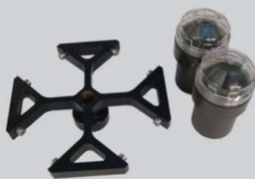
#2307 swing-bucket rotor