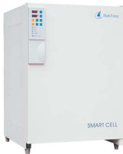
CO 2 Incubator