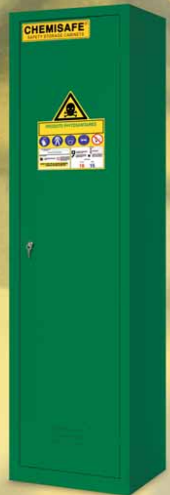
PHYTO 600 - Code CS600V