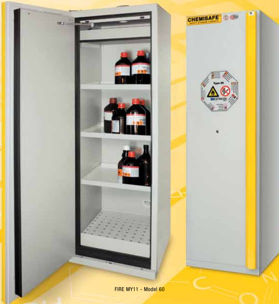
FIRE MY11 - Model 60