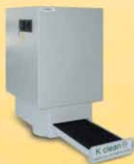
CSF100BP + RSOL