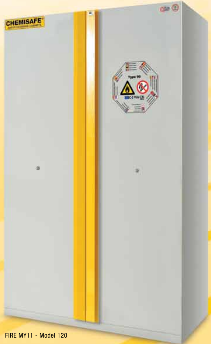
FIRE MY11 - Model 120