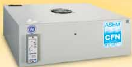
Exhaust filter/fan module according to NFX 15-211 norm