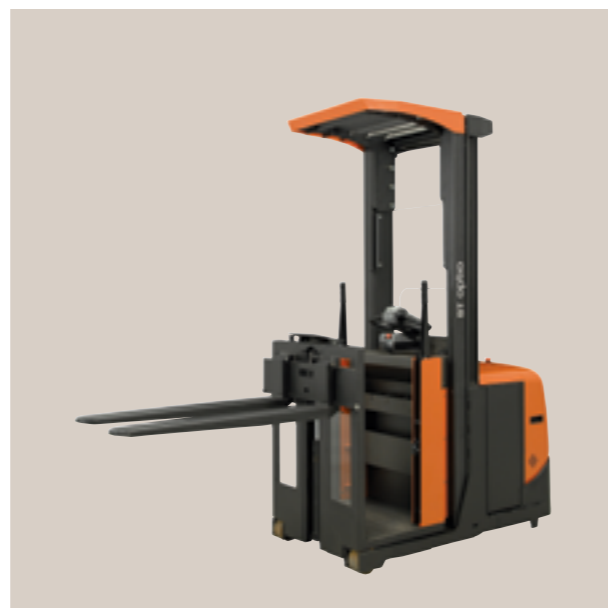
OME100N • Narrow chassis • E-man steering • Picking heights up to 3.4 m (platform height 1.8 m) • Max. capacity 1000 kg • Chassis width 810 mm