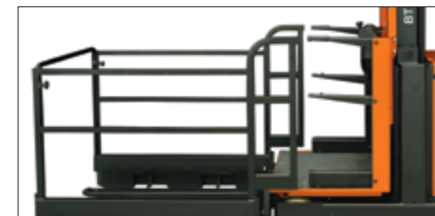
M-series 'W' models have a 'walk-through' design for picking bulky articles

All BT Optio M-series trucks offer an optional E-bar, which allows the mounting (with power supply) of ancillary equipment such as PCs and barcode readers.