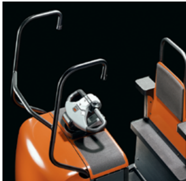
An optional step-up kit aids occasional second-level picking on OSE120, OSE250, and OSE200X models

The BT Powerdrive system allows automatic speed reduction when cornering, to ensure safe operation and confident driving. Automatic speed reduction also applies when driving at the second level ('P' models) or when the truck is pedestrian-operated.