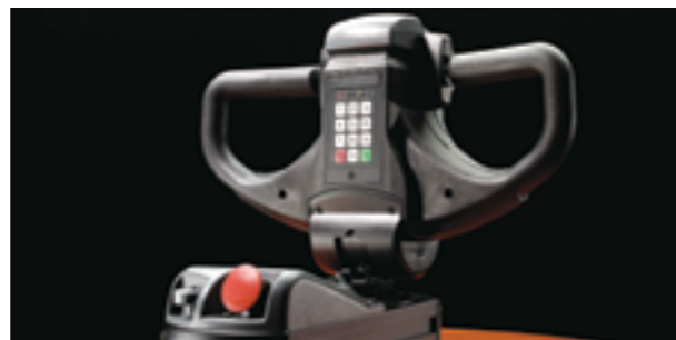
PIN-code activation provides a high level of security as well as allowing the truck's performance characteristics to be optimised for each operator