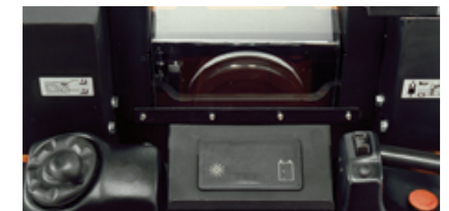
The comprehensive display shows lift height, battery status and drive-wheel position as well as warning and error codes