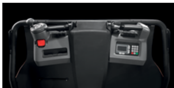
The cabin and controls are designed to make picking to a pallet as easy as possible

Every time the cabin is lowered or the truck decelerates, energy is regenerated back to the battery. Because of this the H-series is able to work for two full shifts on one battery charge in many applications. The battery can be changed quickly thanks to the built-in rollerbed.