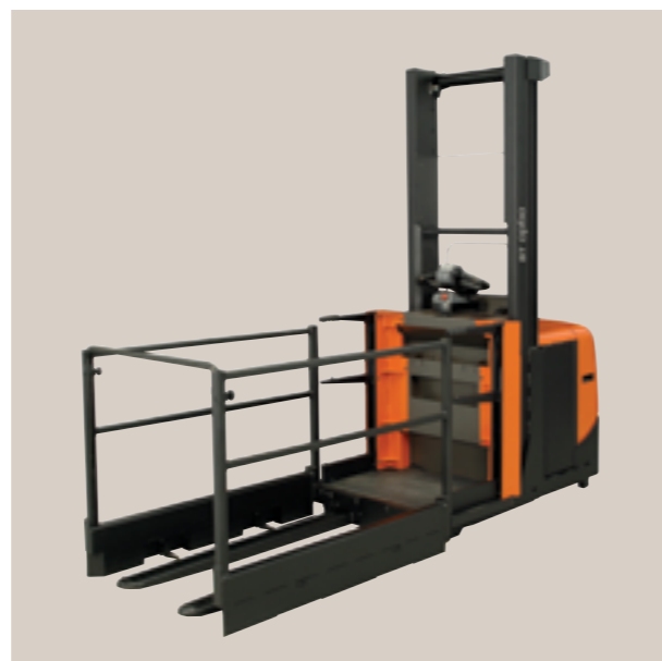
OME100NW • 'Walk-through' version of the OME100N (above) for handling bulky items