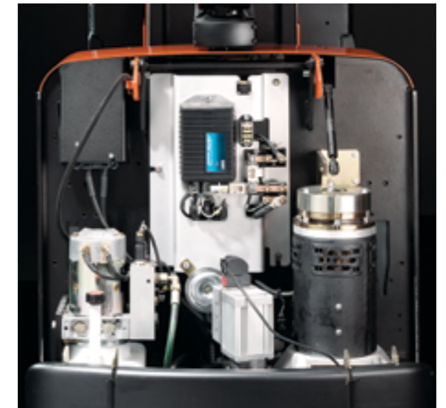
L-series models have excellent service access, helping to keep your operation running