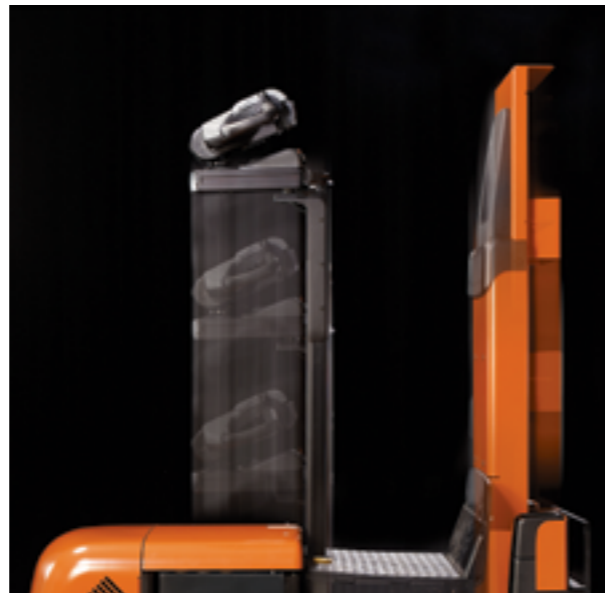
BT Optio L-series models with elevating platforms also have elevating controls, allowing manoeuvring and driving without having to lower the platform