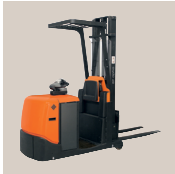
OSE120CB • Max. capacity 1200 kg • CB version can be used like a counterbalanced truck for stacking as well as for conventional order picking