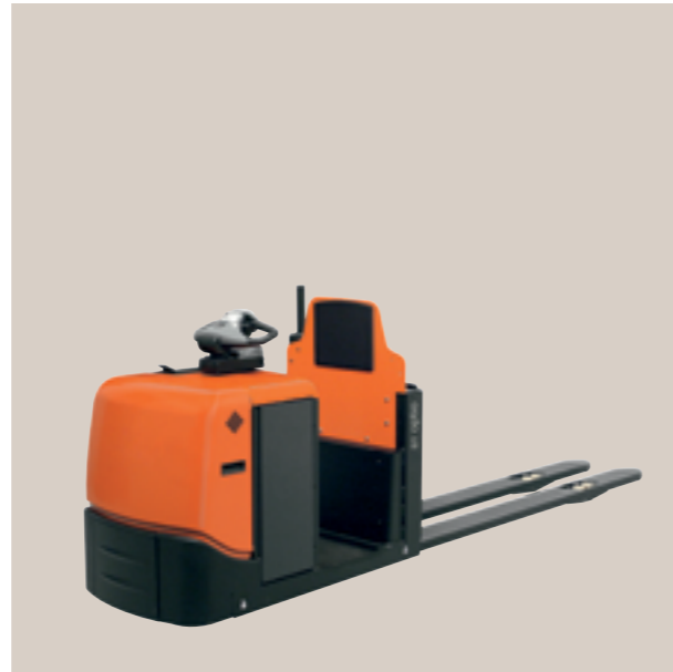
OSE250 • Max. capacity 2500 kg • Available with step-up kit • Fork lengths up to 2.9 m (to handle up to four roll cages or two Euro pallets)