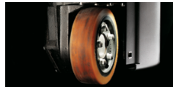
The drive-wheel on BT Optio L-series models sustains significantly less wear thanks to the trucks' electronically controlled acceleration and braking

One of the major wearing parts on most low-level order pickers is the drive-wheel, due to the stress of repeated starting and stopping. The smooth, controlled operation of the electronic braking system on BT Optio L-series trucks significantly reduces drive-wheel wear.