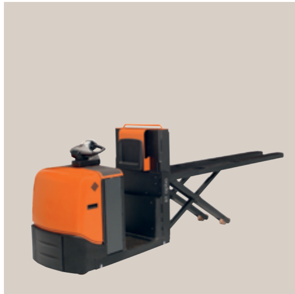
OSE200X • Max. capacity 2000 kg • Available with step-up kit • Elevating forks up to 0.8 m • Fork lengths up to 2.85 m