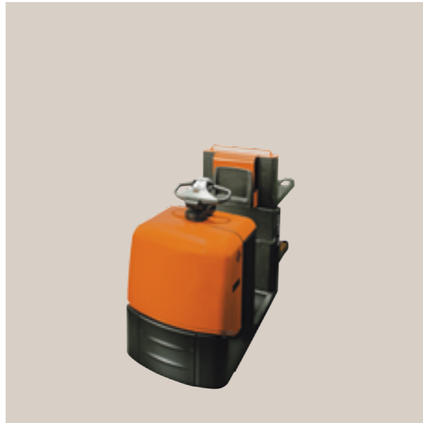
OSE120 • Max. capacity 1200 kg • Elevating forks for better ergonomoy • Available with step-up kit • Fork lengths up to 2.35 m (to handle up to three roll cages or two Euro pallets)