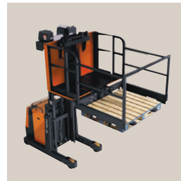
OME100W • 'Walk-through' model of the OME100 (left) for handling bulky items