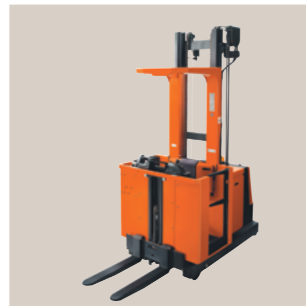
OME100M • Man-up picking from up to 6.3 m (platform height range 2.0 m – 4.7 m) • Max. capacity 1000 kg • Chassis width 970 mm • Cabin widths: 1000 mm, 1200 mm, 1400 mm