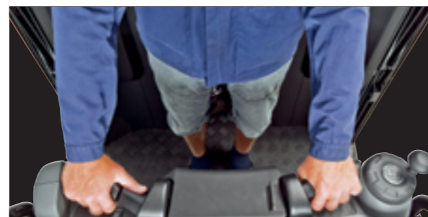
The multiple presence system ensures that the operator is safely in the cab before the truck can move