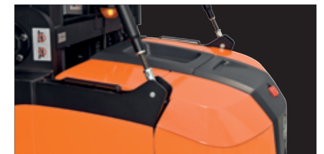
Non-exposed parts, such as the battery cover, are made of plastic to save weight