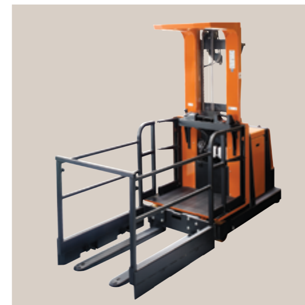
OME100MW • 'Walk-through' version of OME100M for bulky items • Max. capacity 1000 kg • Chassis width 970 mm • Cabin widths: 1000 mm, 1200 mm, 1400 mm