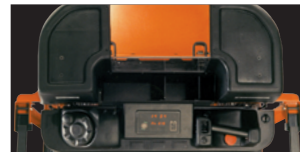
LED indicators and the digital display allow rapid fault diagnosis

The BT Powerdrive system on 'N' models provides reliability and simplicity. CAN-Bus technology means fewer parts and reliable motor and system control. Routine and emergency maintenance is straightforward, with easy access to all components.