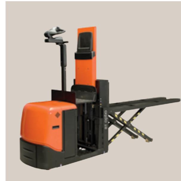
OSE180XP • Max. capacity 1800 kg • Elevating operator platform and controls for intensive picking up to 2.6 m • Elevating forks up to 0.8 m • Fork lengths up to 2.85 m