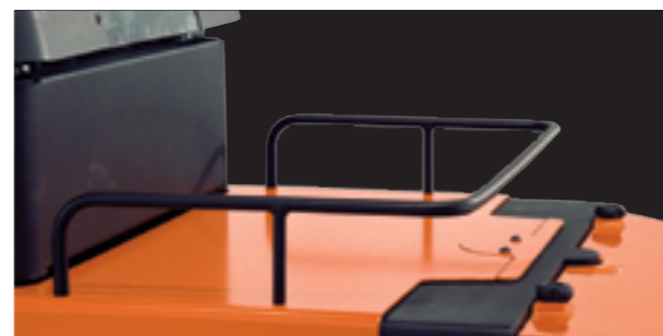
The OME100 and OME100W's parcel rail allows the top of the truck body to be used for temporary storage