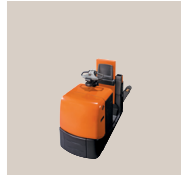
OSE250P • Max. capacity 2500 kg • Elevating platform and controls for intensive picking up to 2.6 m • Fork lengths up to 2.9 m (to handle up to four roll cages or two Euro pallets)