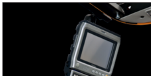
The unique E-bar can be specified in a number of locations for mounting and powering devices such as computers and barcode scanners