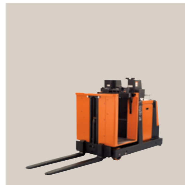
OME100 • Similar to OME100M (below) but without overhead guard • Max. 3.35 m picking height (maximum 1.75 m platform height) • Chassis width 970 mm • Cabin widths: 1000 mm, 1200 mm, 1400 mm