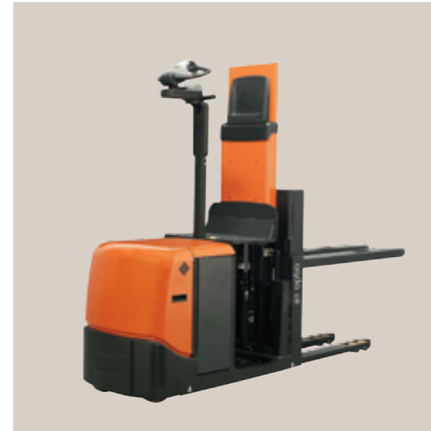
OSE120P • Max. capacity 1200 kg • Elevating platform and controls for intensive picking up to 2.6 m • Elevating forks (up to 0.8 m) for better ergonomoy • Fork lengths up to 2.35 m (to handle up to three roll cages or two Euro pallets)