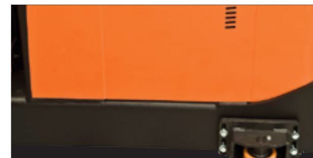
All exterior parts are made of steel, for strength and protection

Periodic maintenance is a requirement for all forklift trucks, but the BT Optio H-series is designed for long service intervals. For example, its AC motors are brushless and its gearbox oil will never need to be replaced. At the end of its life, BT Optio H-series is 99% recyclable.