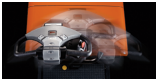
The E-man mini-tiller arm can be offset to either side (option) for easier reversing and walk-with operation

Being able to control the truck in the elevated position has a number of benefits. For example, the precise position of the truck can be ‘fine-tuned’ after the operator has raised the platform, to enable easier picking. The truck can also be driven whilst the platform is being lowered or raised. The platform can be lowered using a foot-operated switch on the platform floor, which is invaluable if the operator – as is likely – is holding an item while lowering the platform.