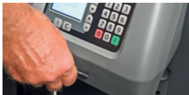
BT Optio H-series requires either a PIN-code or an ID key (option) to start

Efficient LED arrays provide in-cab lighting and there are several places to store items. A writing pad is integrated in the auxiliary lift cover. A cooling fan and radio/CD unit can also be specified.