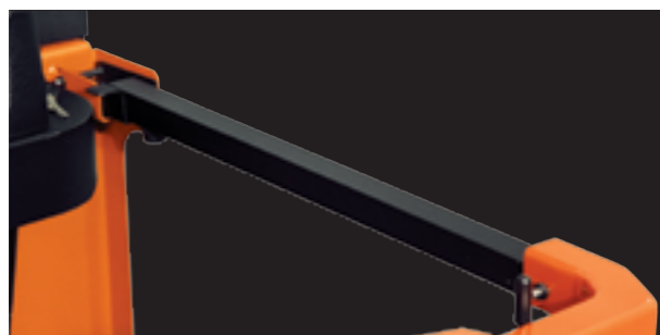
All M-series models feature folding side gates (optional on OME100N and OME100)

A complete auto-test routine is carried out every time each M-series model is activated. This is repeated continuously during operation to ensure safety.