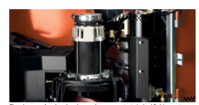
The absence of carbon brushes and power contacts in its AC drive motor reduces maintenance downtime