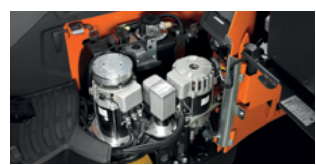
BT Reflex R-series has durability designed-in with its sealed electrical units, brushless motors and leak-free connectors

Routine servicing and safety checks are of course essential. It is also important to keep time lost to servicing to the absolute minimum. The latest generation of BT Reflex reach trucks has extended service intervals due to the use of long-life or maintenance-free components. On-board diagnostics can quickly pinpoint any faults as they occur and ensure that remedial action is fast and effective. This is further supported by exceptionally easy service access to all areas of the truck.