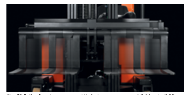
The BT Reflex F-series can spread its forks over a range of 0.54 m to 2.22 m

Maximum lift height is 8 m, load capacity 2700 kg.