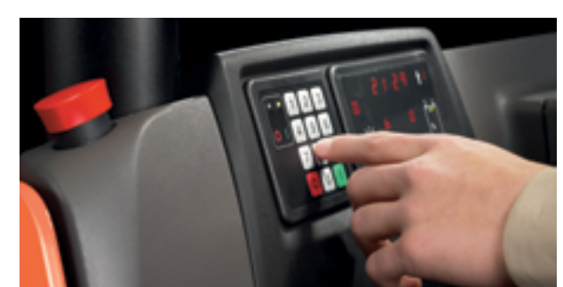
Unique to BT, Reflex M offers PIN-code entry as standard to ensure that the truck is only used by authorised personnel

The design of the cab not only provides panoramic vision for the