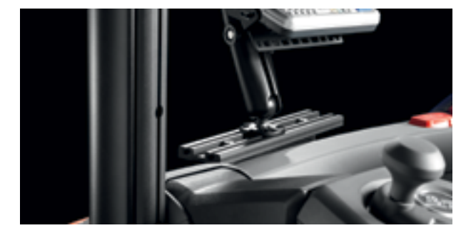
The optional E-bar is designed to carry ancillary equipment, offering standard interfaces and a built-in power supply

BT Reflex trucks are powered by AC motors, which ensure maximum energy efficiency. Consumption rates are low on all BT Reflex models, with the added benefit of energy being recycled on deceleration and braking. For multi-shift operations these trucks can interface with battery change systems and the battery can be quickly and easily power-released while the driver is seated in the cab.