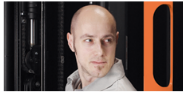
The design of the cab not only provides panoramic vision for the operator, but also provides excellent protection – the operator is fully contained within the profile of the cab

Pedals are laid out as in a car for maximum ease-of-use, and safety in emergencies. The left foot 'dead-man' pedal sounds a beeper when released, and may be programmed to apply auto-braking. This safety feature directly reduces the risk of left foot injury.