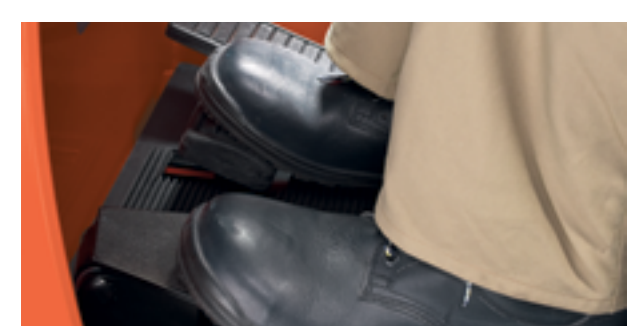
Electronic braking adds to the N-series' driveability

'E' stands for efficiency and effective integration with warehouse management systems. The E-bar is a universal mount for warehouse management devices such as on-board computers, radio data terminals, and barcode readers. It can be equipped with an integral 12 V or 24 V DC power supply, ensuring that Reflex M is ready to fit into any application.