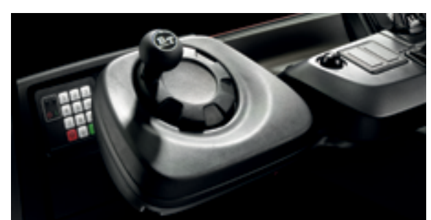
BT Reflex N-series' electronic, progressive 360° steering is perhaps the most significant contribution to the driving experience

Electronic fork control provides a cushioning effect during lifting, lowering, and reach movements, to allow high-speed but