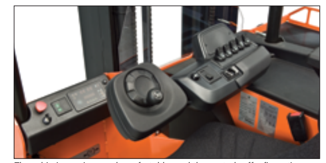
The cabin is spacious and comfortable, and the controls offer fingertip operation, for precise and effort-free load handling