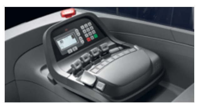
Standard mini-levers allow fingertip control of each fork movement

This option allows frequently accessed lift heights to be preprogrammed for fast and accurate stacking. The pre-selection system differentiates between placement and retrieval cycles, accurately controlling fork movements throughout the process. Information is displayed on the load information display, which also shows lift height and load weight.