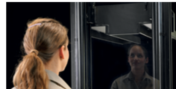
The BT Totalview design concept ensures the fork tips are visible from the operating position

All BT Staxio models come with useful storage compartments on top of the truck body. An optional 'E-bar' allows mounting of a writing table and shrinkwrap holder, as well as powered ancillary equipment such as PCs, radio-data terminals and barcode scanners.