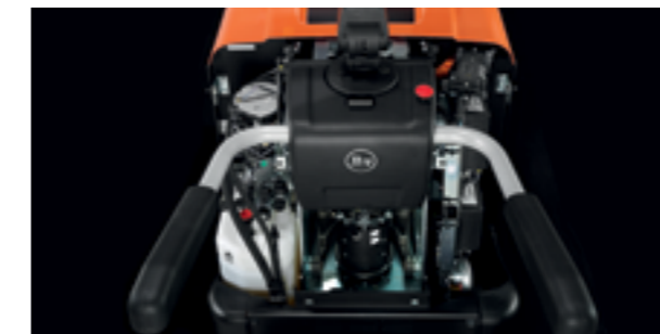
BT Powerdrive reduces components to a minimum

Part of the BT Staxio P-series range, the RWE120 is a pedestrian reach truck with moving mast. It also has adjustable width forks, for mixed or bottom-boarded pallet handling. Its maximum lift height is 4.8 m and load capacity 1200 kg.