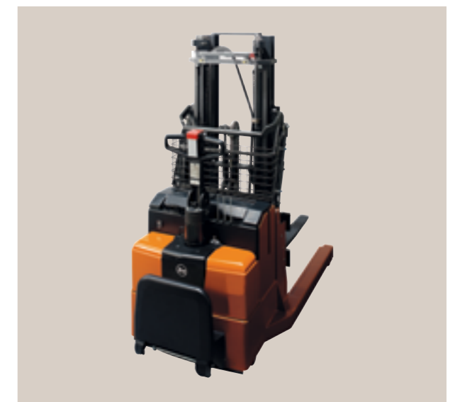
The RWE120 is a pedestrian-operated reach truck with a lift height of 4.8 m