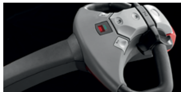
The tiller arm's control handle incorporates BT Powerdrive technology, for easy, intuitive control

Lifting speed on all BT Staxio models can be precisely controlled