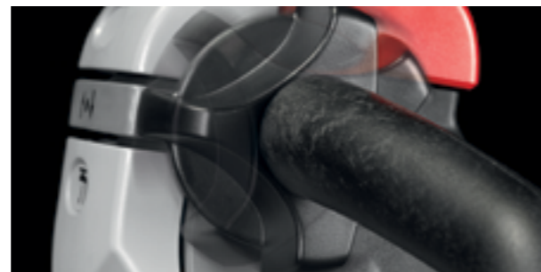
The Click-2-Creep function allows the truck to be manoeuvred with the handle upright