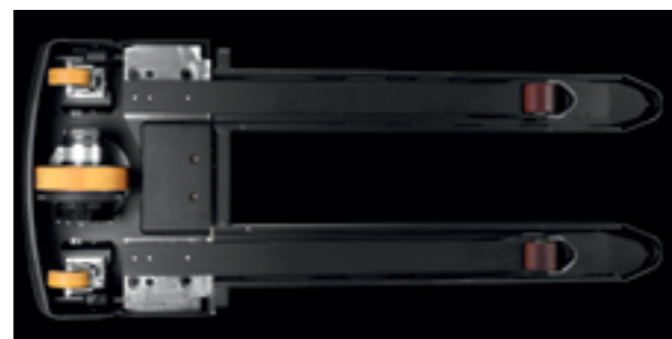
The HWE100 has BT’s unique 5-wheel chassis for excellent stability and control