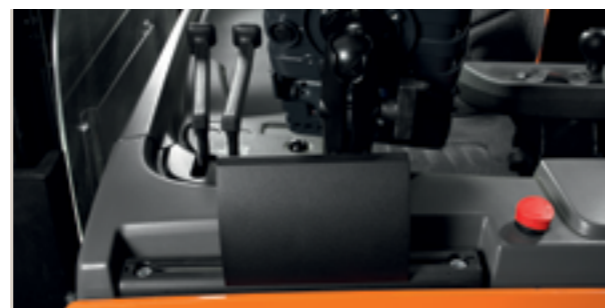
The E-bar universal mount for warehouse management devices such as PCs, terminals, bar code readers