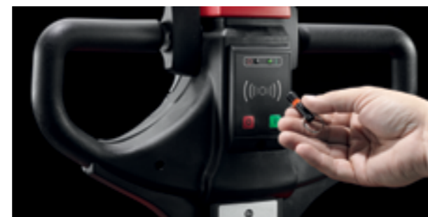
'Smart access' with a remote key or card ensures the truck starts-up with the appropriate performance settings for each operator

All models are available with the E-bar mounting rail for ancillary equipment such as writing tables and shrinkwrap holders. It can also incorporate a power supply for items such as PCs, radio-data terminals and barcode scanners.