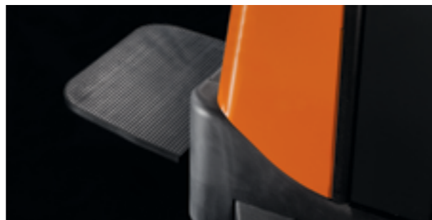
BT Staxio P-series models can be specified with or without rider platforms

A large emergency button is located at the tip of the handle. This ensures that the truck's direction will be reversed immediately if the handle encounters an obstacle, preventing the truck from crushing the operator. To further ensure operator safety, all models feature skirting that offers full protection to the feet.