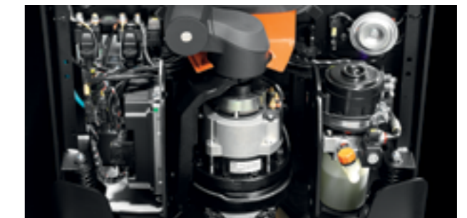
The fixed motor has no moving cables