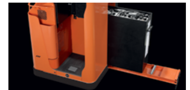
The battery on S-series models is seated on rollers with a built in battery table, allowing easy sideways battery exchange