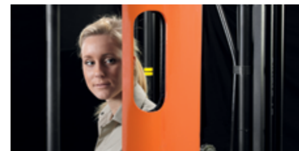
The visibility window adds to the S-series' high safety standards

With the forks lowered the support arm lift has a maximum capacity of 1600 kg for horizontal travel and 1200 kg for stacking.