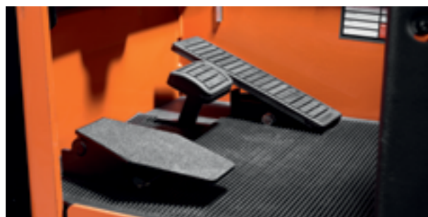
Pedal layout is as in a car, optimising safety and productivity

The SRE135L and SRE160L models feature elevating support arms that allow effective operation on ramps or over uneven surfaces. These also allows double pallet handling, with 675 kg + 675 kg (SRE135L) and 800 kg + 800 kg (SRE160L).