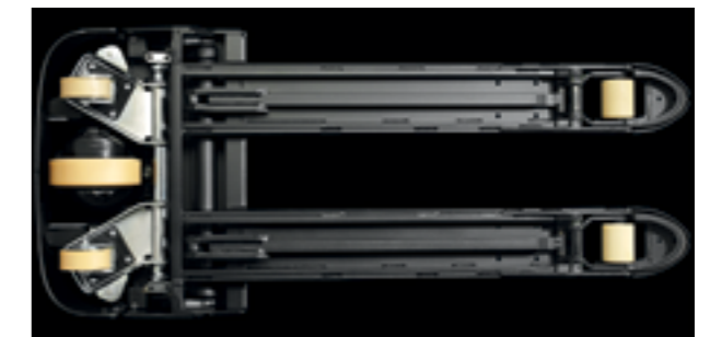
BT's unique 5-wheel chassis improves stability on ramps