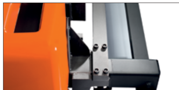
The HWE100S offers the same features as the HWE100 but also has straddle arms for handling different pallet sizes. Both models have a maximum lift height of two metres

The HWE100 features the unique BT Castorlink system with castor wheels that rotate within the truck’s body profile. This provides smooth and easy operation on ramps and reduces the risk of wheel damage.