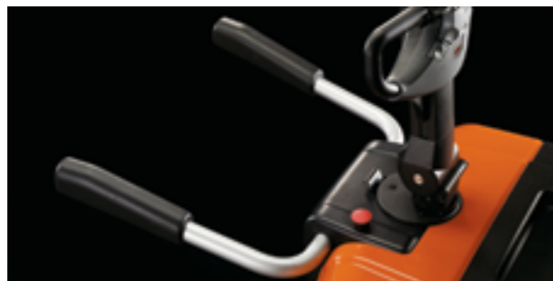
Folding sideguards offer protection to the operator without compromising the manoeuvrability advantages of the flip-down platform

The ergonomic handle offers an intuitive interface between operator and machine. Designed to be equally accessible to the right and left hand, its butterfly controls provide forward/rearward acceleration. Other essentials such as lift/lower, and horn are all within fingertip reach.