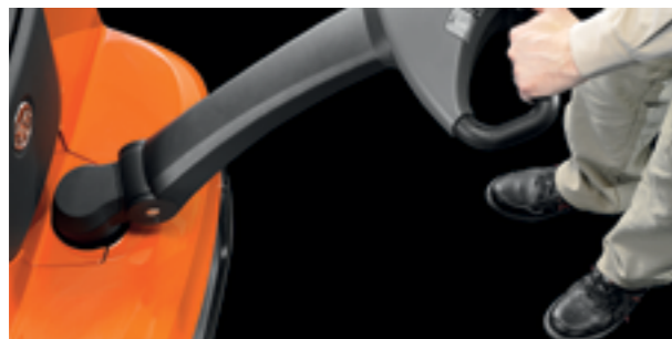
BT Staxio W-series' profile allows manoeuvrability in the tightest conditions

W-series' chassis skirt is just 35 mm from the ground and rounds away from the operator's feet, providing the perfect balance of foot protection without compromising the truck's manoeuvrability on ramps and other slopes. When working on gradients the truck is designed to ensure no risk of rolling back when starting or stopping.