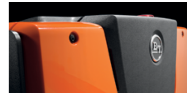
The hood is secured by two bolts for fast access

connectors and CAN-Bus wiring all add up to maximum reliability. W-series models are designed to be serviced only once a year in typical single-shift operations.