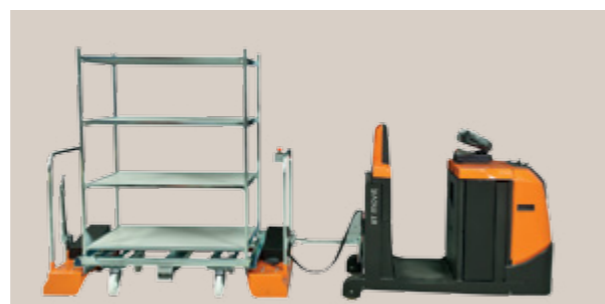
A BT Movit TSE300 towing host carrier, loaded with a separate shelf carrier.