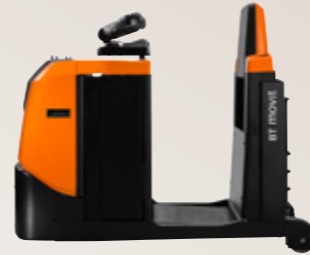
S-series – TSE300