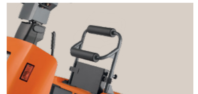
The backrest is height-adjustable to accommodate different operators in comfort.