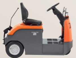
R-series – 4CBT2/4CBT3/4CBTk4