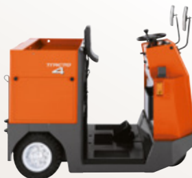
S-series – CBTY4