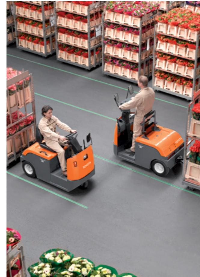
4CBT2 (left), 4CBTY2 (right)