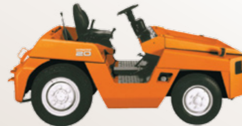
R-series – 2TG20/2TG25/2TD20/2TD25