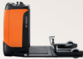
N-series – TSE100/150, TSE100W