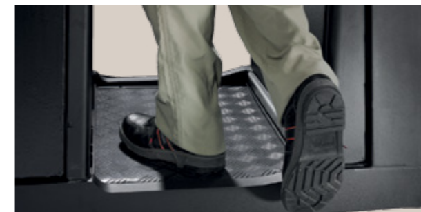
The TSE300's low step-in height reduces the strain of repeatedly stepping into and out of the truck. The floor is suspended to reduce vibration, enhancing driver comfort.

The E-man control system on BT Movit S-series models is based on an extremely flexible steering arm with touch-sensitive activation of the drive function and effortless electronic steering. The steering arm is designed to follow the operator's position. It can be moved left and right to allow pedestrian control, walking alongside.