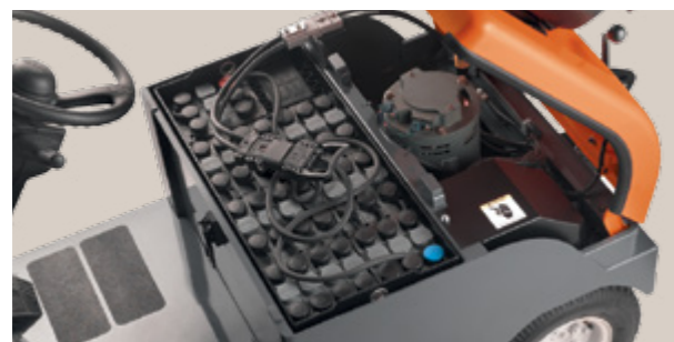
Toyota Tracto R-series electric models feature a 48 V electrical system with AC motors, for responsive, energy efficient power delivery and simple maintenance

Toyota durability is built-in to every part of these models, including the Toyota-designed and built engines and transmissions. These achieve low exhaust emissions compliant with latest diesel emissions regulations.