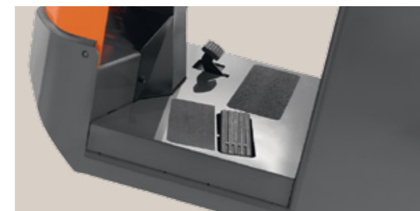
S-series' low step-in height makes getting on and off easy. The Operator Presence System (left-hand pedal) ensures that the tractor cannot be driven unless the operator is standing in the correct position.

The Operator Presence System (OPS) only allows operation of the tractor if the operator is standing in driving position, enhancing safety.