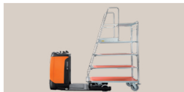
A BT Movit N-series truck docked with a step carrier.