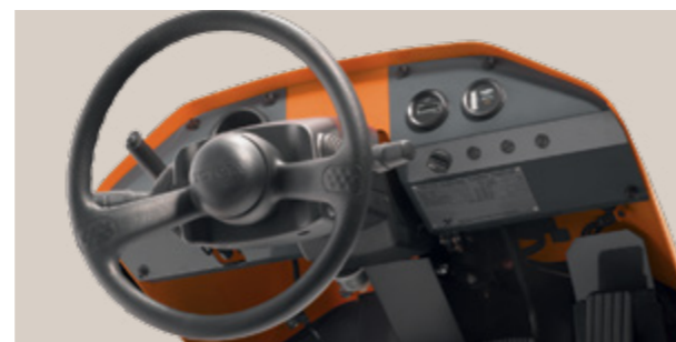
R-series models' car-like control configurations, with levers positioned at the operator's fingertips, make them easy to operate for long periods.