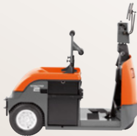
S-series – 4CBTY2/4CBTYk4