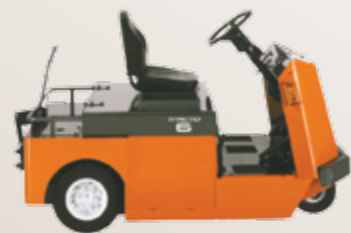
R-series – CBT4/CBT6