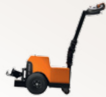
W-series – TWE080/100/150