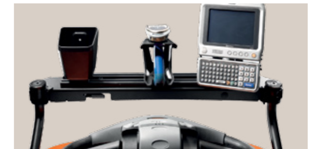
The BT Movit S-series E-bar option allows the mounting and powering of ancillary equipment such as computers and barcode scanners.

One of the major wearing parts on most towing tractors is the drive-wheel, due to the stress of repeated starting and stopping. The smooth, controlled operation of the electronic braking system on BT Movit S-series trucks significantly reduces drive-wheel wear.