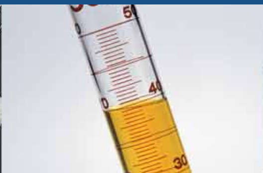
Essential oils, Flavors and Fragrances