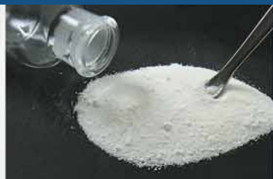
Sugars and Sweeteners