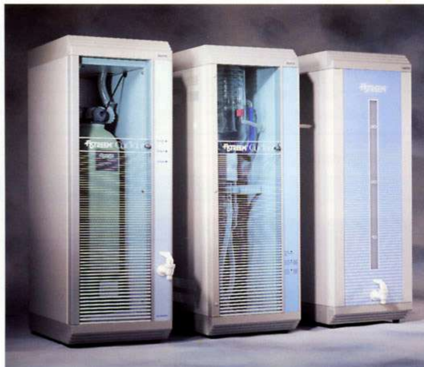
Deioniser, 4 l still and reservoir

All Cyclon Stills are supplied with accessories which enable the user to adapt from tap feed to treated feed