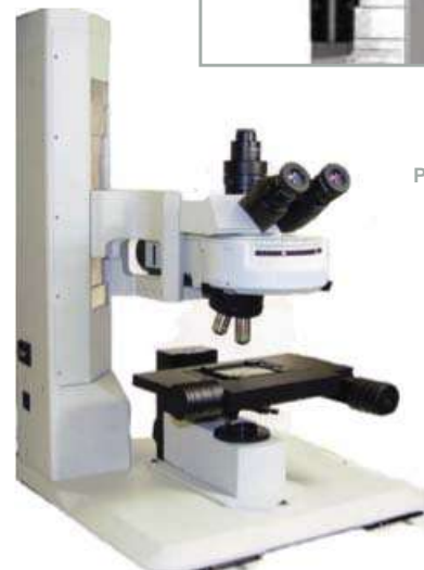
Pro Z stands

Prior Scientific Modular ProZ components offer a wide range of configurations to meet your Z focus and XY microscopy needs. Compatible with Prior ProScan and Optiscan control systems and Lumen and Lumen LED illumination systems. Three different stage mount options are available. A standard BX dovetail is available for basic reflected light applications. For transmitted light applications the ProZ Stand has options for both a brightfield/oblique transillumination module that uses a tiltable sliding mirror or a full Koehler illumination module.