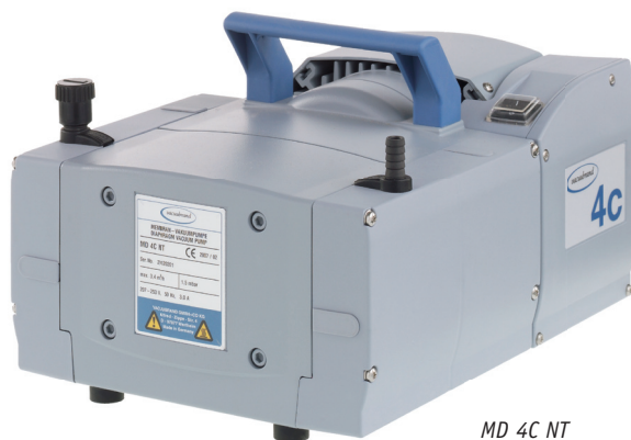
MD 4C NT down to 1.5 mbar